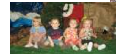
Adults and children of all ages enjoyed a week of fun and learning at VBS 2009!