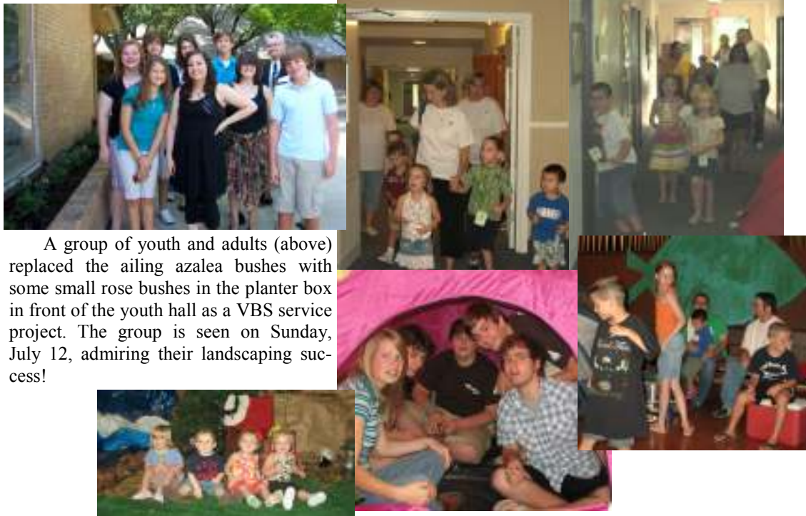
A group of youth and adults (above) replaced the ailing azalea bushes with some small rose bushes in the planter box in front of the youth hall as a VBS service project. The group is seen on Sunday, July 12, admiring their landscaping success!

The Goldenaires will meet at 10:30 a.m., Thursday, July 23, to continue their discussion of the book The Shack by William Paul Young. Make it a point to join this group of lively seniors for discussion, fellowship, and light refreshments. Even if you haven't read the book, you will enjoy the discussion, and will be welcomed by the group.